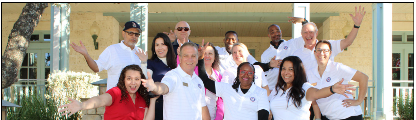
Pictured above: 2025 Golf Tournament Volunteers

A special thank you to Northpark Chrysler Dodge Jeep Ram for sponsoring the hole-in-one contest.