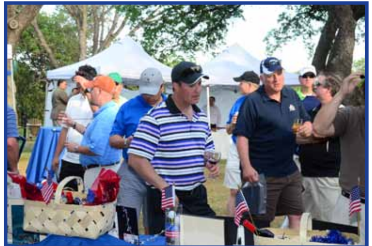
Golf teams making selections during the Golf tournament silent auction.

Since 1992, Sigma has been providing industry leading datacenter solutions. Sigma's extensive, diverse and local skill base enables customers to get the most out of their IT investment by reducing costs, risk and increasing business impact. Sigma empowers customers by providing them with a single integrator that can provide solution design, implementation services and on-going support.