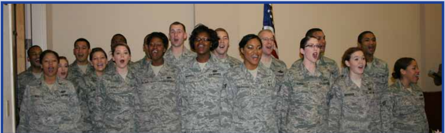
Air Force Tops & Blue sing the National Anthem at the Fisher House Inc. Volunteer Luncheon on 26 April at Lackland Air Force Base. About 85, volunteers enjoyed the great voices from the Air Force Tops & Blue along with lunch and awards presentations.